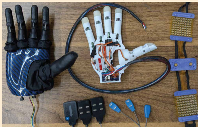
Experimental equipment used for testing.

the brain when they attempt these movements? In the next article, we explore how brain imaging is helping us understand the neural foundations of these movements and how the brain's representation of a missing hand both mirrors and diverges from an intact limb.