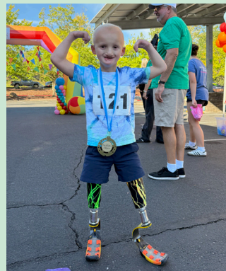
Shine, SEBCM Advocate